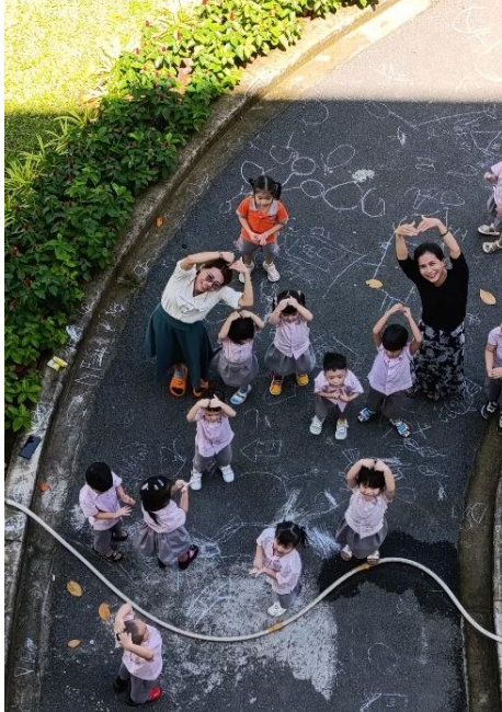
K2 Students use chalk to express their creativity and talent during a freestyle drawing activity.

Our SWLG Awards go to our hardest working and highest achieving students. This month's winners are as follows: