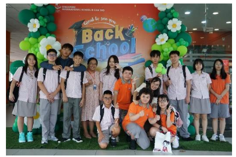
High School Students happy to return after Summer Holiday (above) while our Year 3 Students study in groups in English class (below).