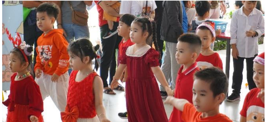
SIS Students dancing at our Christmas Charity Fair