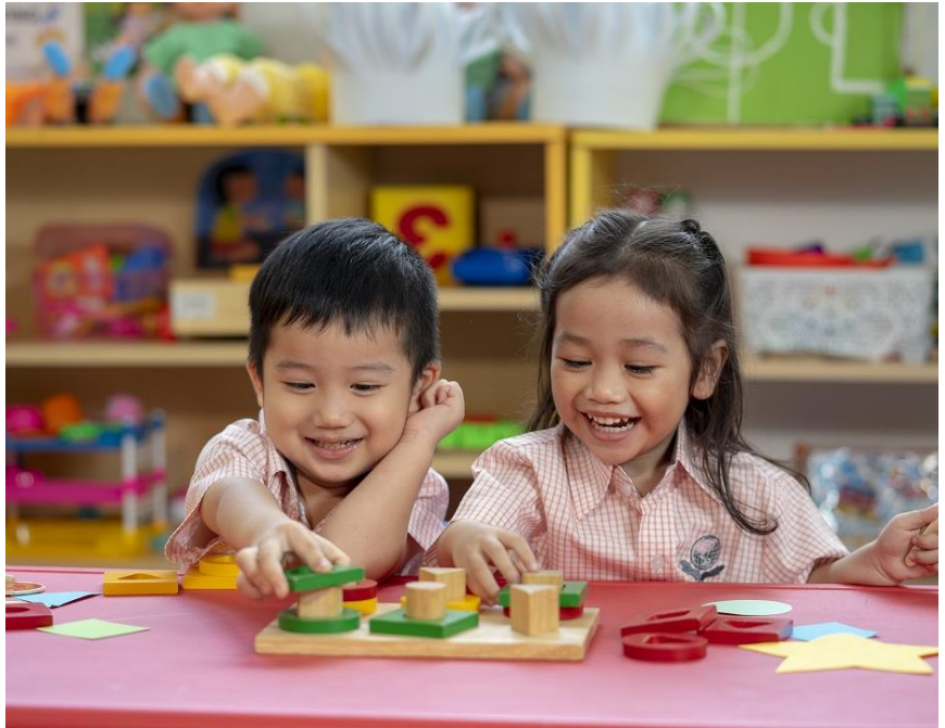
The Joy of Learning and Play at Singapore International School