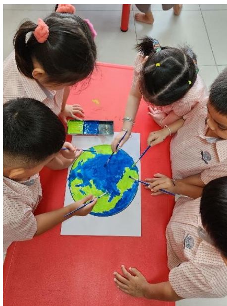
K2 Students – enjoy coloring the Earth during a fun Earth Day activity.