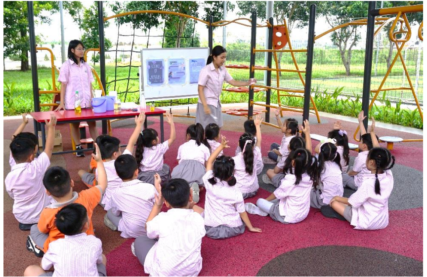
STEM Activity – Y1 students raise their hands in a student-led activity