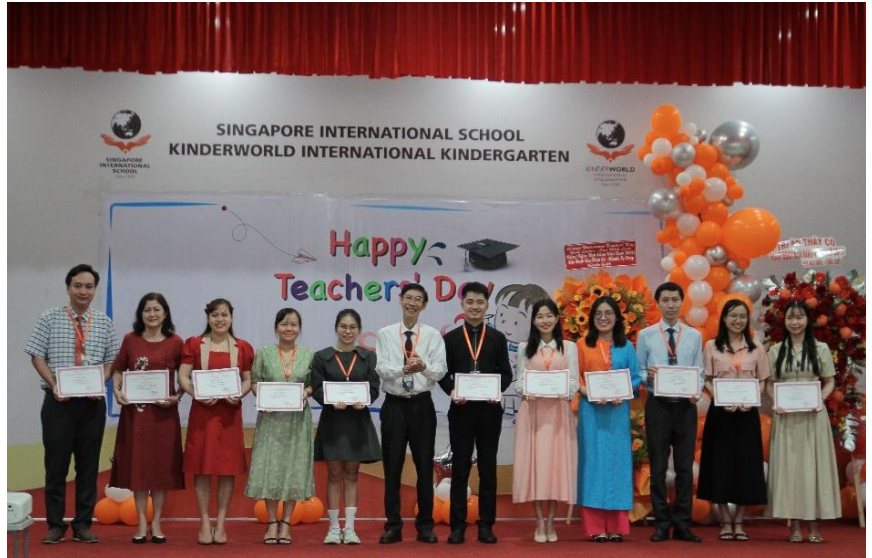
Teachers' Day – Teachers receive certificates for excellent teaching.