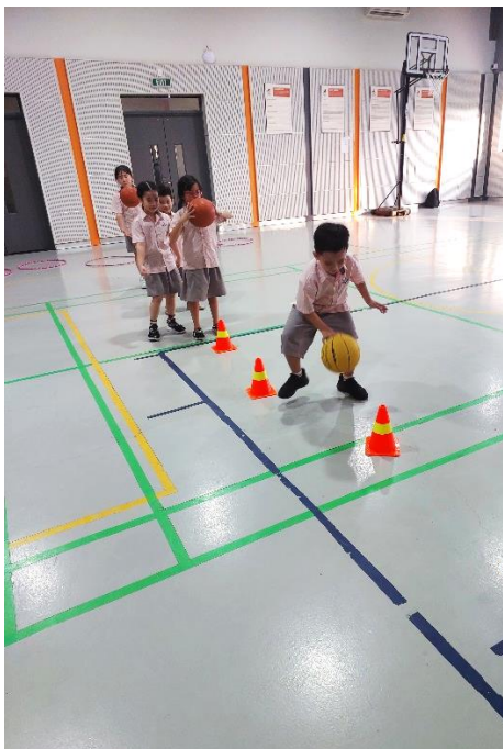
Indoor Games After-School Activity allows students to practice many things, such as dribbling a ball.

Our SWLG Awards go to our hardest working and highest achieving students. This month's winners are as follows: